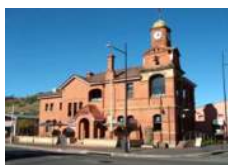
Picton Post Office