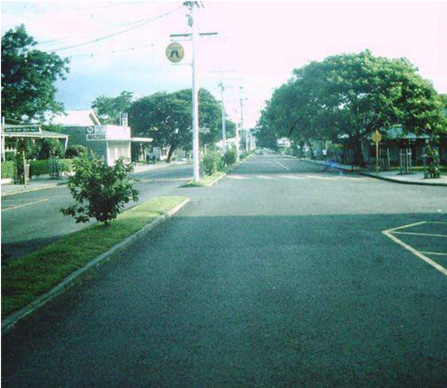
The main street in Rabaul taken about 1970

The next one is of the main street in Rabaul taken about 1970. The whole area is now covered by volcanic ash and lava.