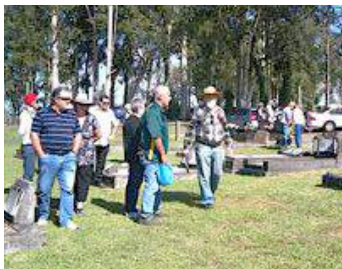
At Jilliby Cemetery, 24 th April 2016.

Left, Volunteers busy in the tent . Right, some of the folk enjoying the walk and the sunshine.